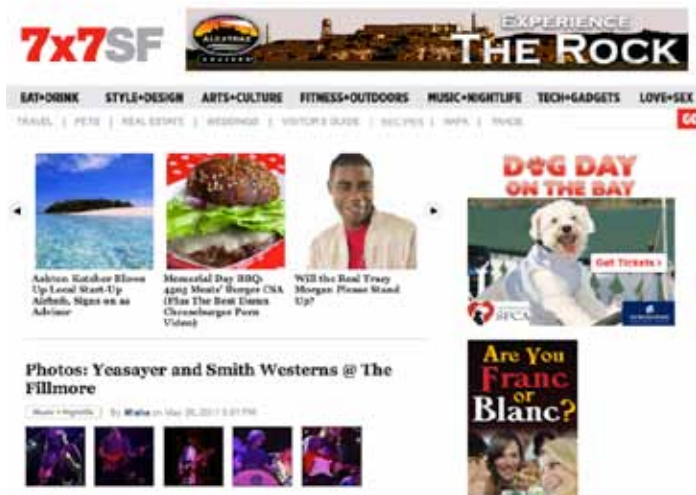
7x7SF on the desktop

An example of this approach is 7x7SF.com. Below, you can see the main site, and then its mobile version (m.7x7.com).