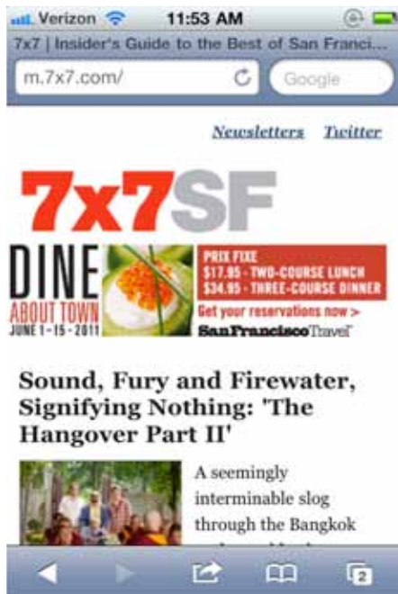
7x7SF on the iPhone