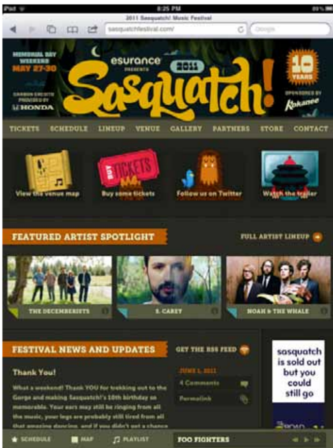
sasquatch.com on the iPad

An example of a site built on Drupal using responsive design is Sasquatch.com. Below you can see how the site looks on the iPad and the iPhone, automatically adjusted to best serve each device's form factor.